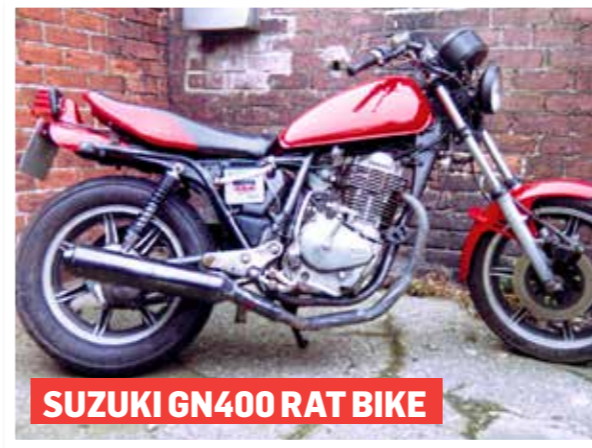
SUZUKI GN400 RAT BIKE