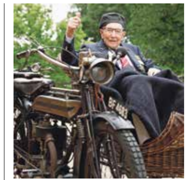
They truly don't make them like Capt Sir Tom Moore these days

98 and recovered from that. I'm sure he went over the handlebars of his Norton a few times back in the day too! Can you imagine for a minute heading into the jungle in Burma on a reconnaissance mission, it would be red hot, the engine would be on the verge of seizing and then you've also got people trying to kill you. Basically dodging bullets all while hoping that the bike didn't break. At the end of the day he was 100 and he achieved so much. What a legend. RIP Captain Tom.