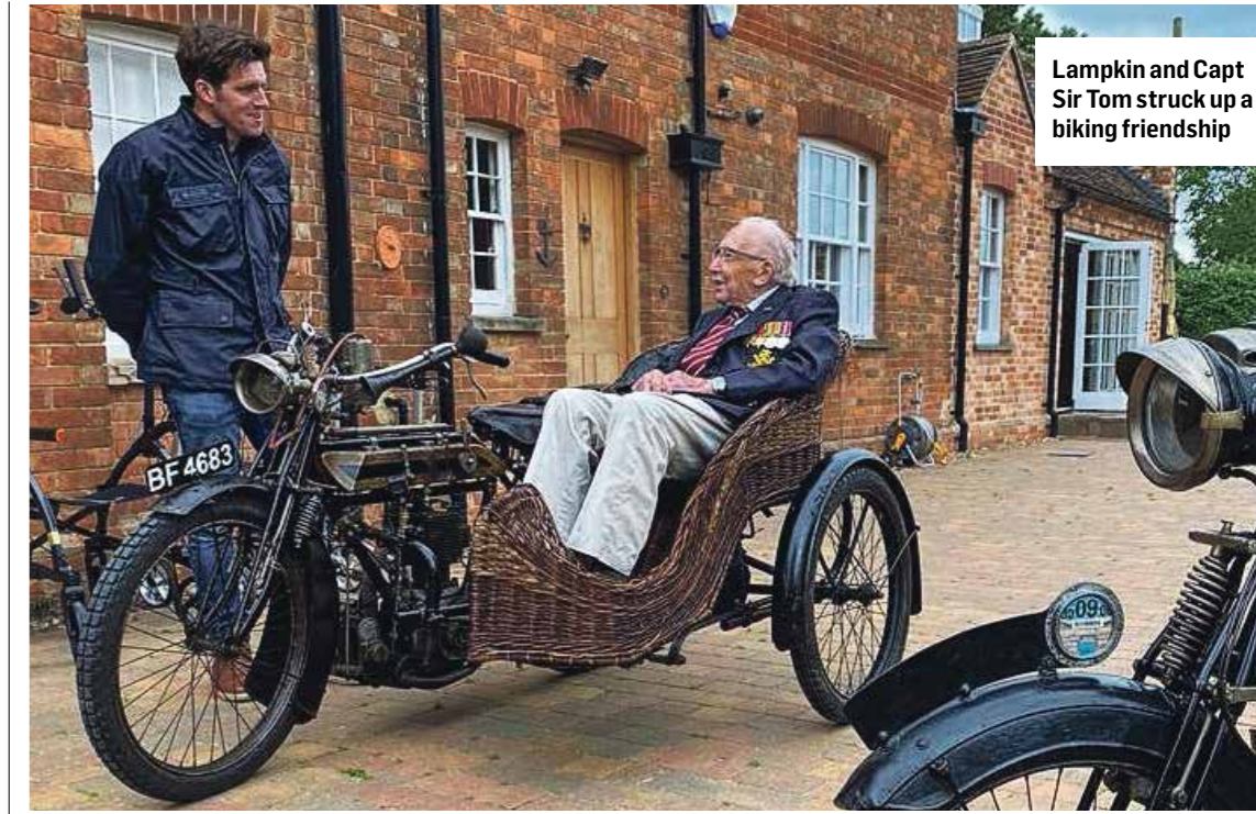
Lampkin and Capt Sir Tom struck up a biking friendship

a biker, our ears pricked up. So he went up 100% in everybody's estimations in the bike fraternity. What a whirlwind year he had. Can you imagine the requests he'd have been getting? Dougie Lampkin told me Captain Tom had a couple of visits to their place to look at bikes and he absolutely came alive the moment he saw them. Before Christmas I picked up his autobiography and read all about how 10-time TT winner Stanley Woods was his hero, so all of a sudden I felt like Captain Tom was my mate. He broke his hip when he was