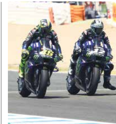
Wrestling one of these beasts for 25 laps in 40 degree is no fun at all, says McPint

And while I never like to see anyone injured it has made it interesting hasn't it? Next up is Brno and I can't wait.