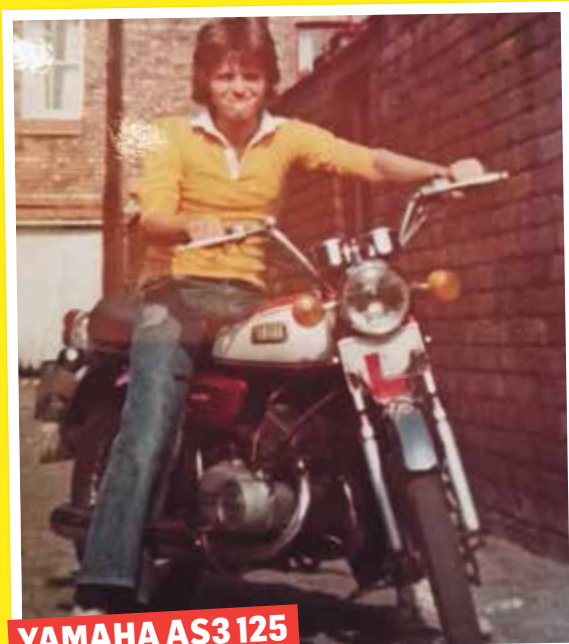
YAMAHA AS3 125