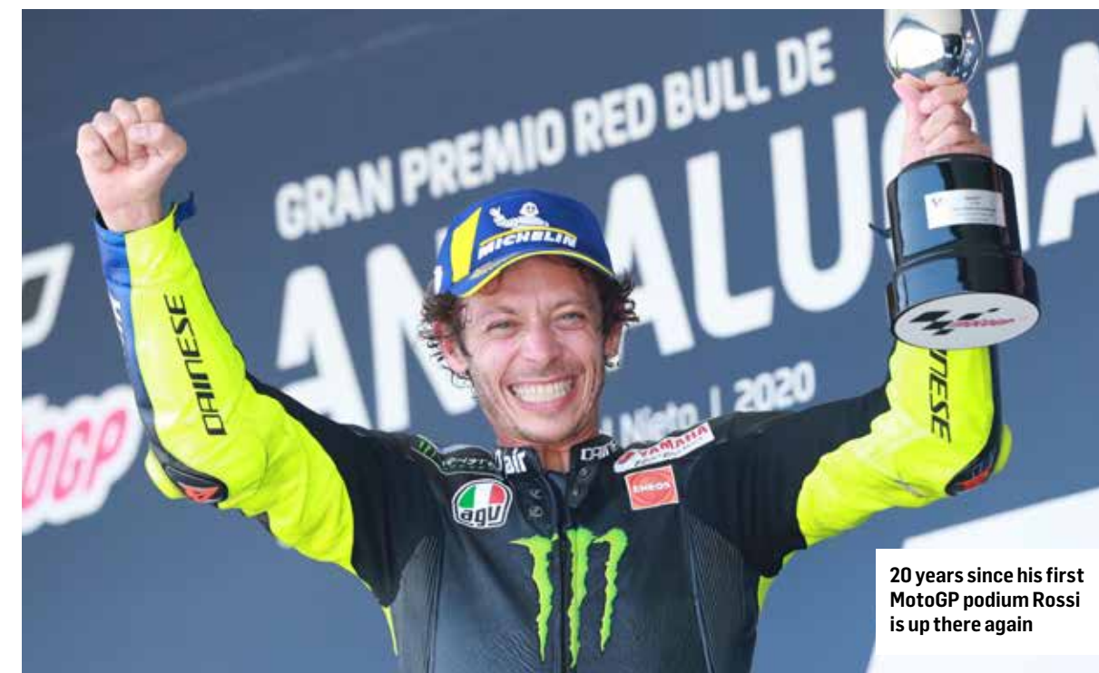
20 years since his first MotoGP podium Rossi is up there again

I don't think people sat on the sofa appreciate what it's like to race in that heat. Those riders were in a world of hell sat in a group of 300bhp bikes spitting