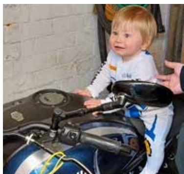
Just don't let him find the keys...

I've just read that Hull and Humberside police are going back to the old trick of putting mobile cameras in parked and unmarked vehicles. Whilst I applaud safety, sneaky tactics will only infuriate motorists. Where I live, we are plagued with mask-wearing scrotes on nicked bikes running rings around the police. Let's get away from lazy easy-target policing and make them do their job. Ian Rivers, email