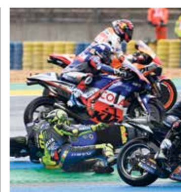
Time to send for the man with the magic sponge from football

also some of the fittest people in the world and while this may open up a can of worms... I'm sure they have different painkillers from the rest of us. There's no way they're on paracetamol is there? There are a million ways to hurt yourself. You can end-over-end at 120mph and get up with no injuries or you can topple off at 20mph, hit your head and give yourself concussion. Maybe the MotoGP guys get access to the football 'magic sponge'. Just a guy with a bucket who makes them feel fine with a quick wipe.