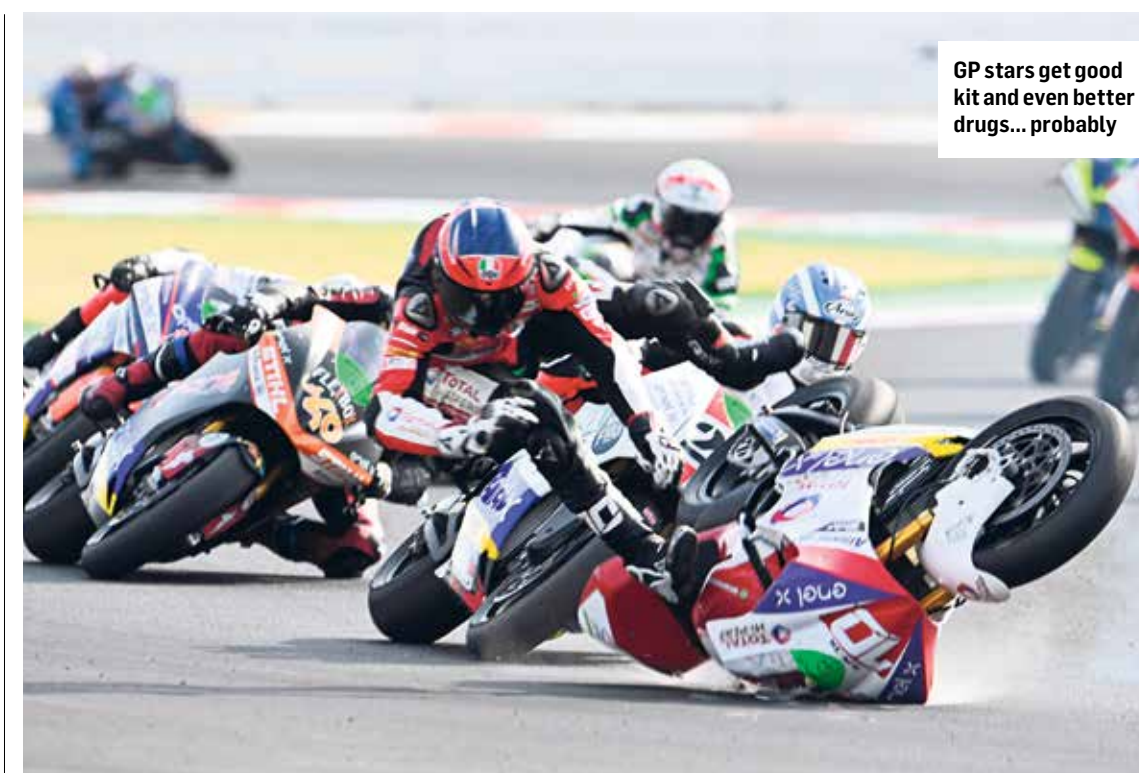
GP stars get good kit and even better drugs... probably