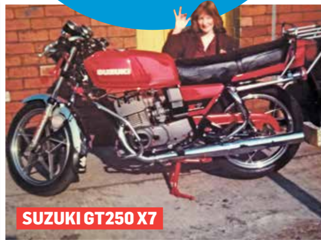
SUZUKI GT250 X7