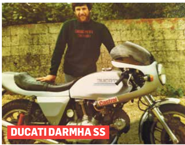
DUCATI DARMHA SS