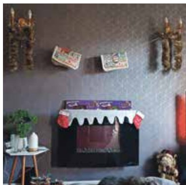
MCN as Xmas decorations? We love it