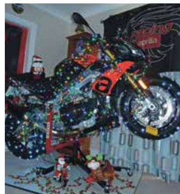
Well, who wants a tree anyway?