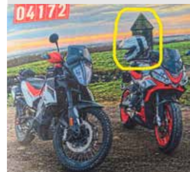
You can cover a lot of miles when your bike has a rocket strapped on...

Electric's not so green Emmanuel Baumard (MCN Letters, March 8) can't have read the section of the European Environmental Report, part of which MCN published, which exposed the fallacy of electric vehicles in terms of their emissions during manufacture. These vehicles produce vastly more emissions than the ICE do in manufacture, which means that ICE cars can travel in excess of 155,000 miles in the worst case before equating to the manufacturing emissions of electrics. I believe that hydrogen will become the energy of choice, rendering electrics obsolete as it can be utilised from existing fuel stations and is suitable for a wide range of vehicles. Bob Brimfield, Sussex