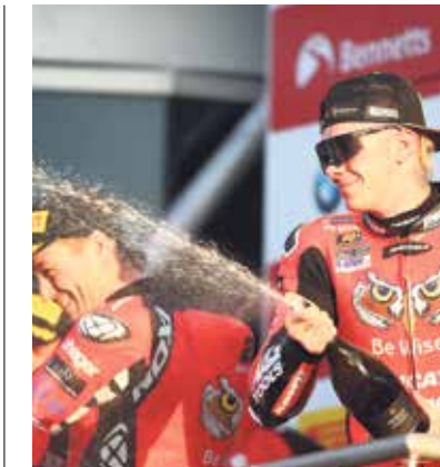
We'll be swapping the podium fizz for hand sanitizer and social distancing

I know the number of rounds has been reduced but the British Supercup in the 1990s was only six rounds. This year we'll have 18 races to decide the championship and whoever has the most points at the end of that is champion – end of. And 13 MotoGP races is enough to call it a world championship.