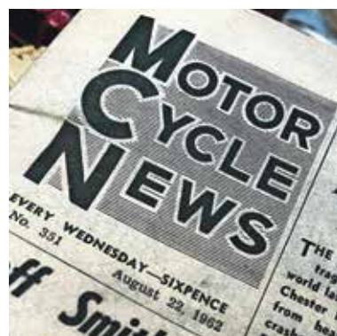
A slice of MCN and biking history

I work in Leeds city centre with my office adjacent to a bike park and over the last couple of years there have been numerous bike thefts. These have become bolder and more visible in recent times, including yesterday, when thankfully the thieves were prevented from taking