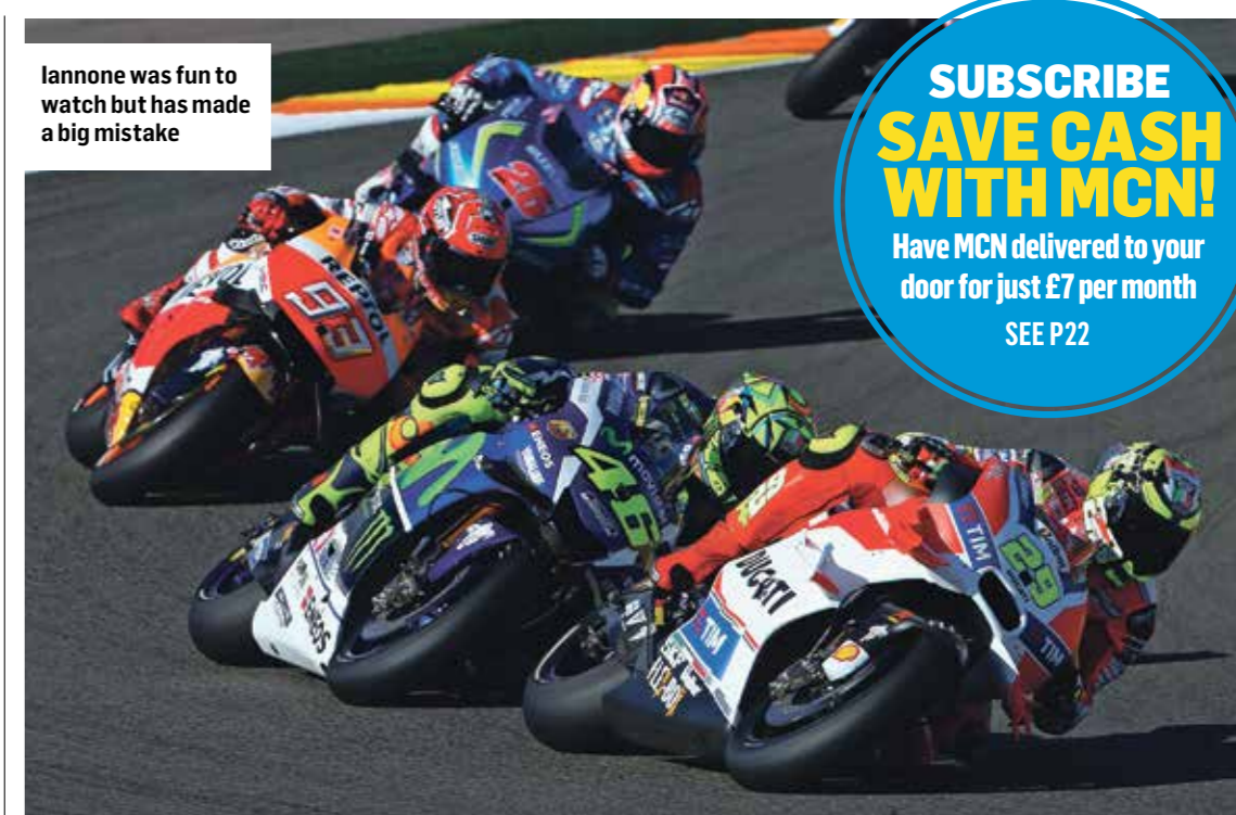
Iannone was fun to watch but has made a big mistake

Now he's got to take it on the chin and hopefully in the future people will understand that this is what you get if you break the rules. I honestly don't know what he was playing at. People are also saying that he was doing it for his modelling career! He's not the most handsome bloke in the world, is he? I'm not saying I am either... I don't know what mirror he's looking into, but I could do with borrowing it. I still like to follow him on