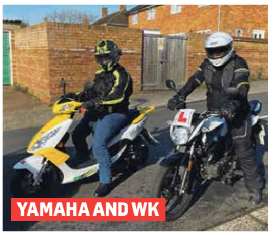
YAMAHA AND WK