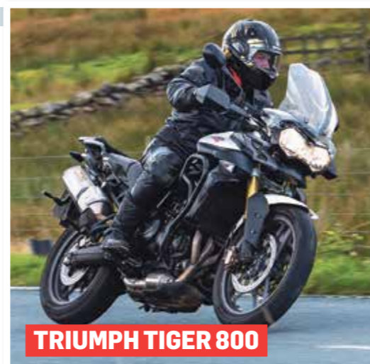
TRIUMPH TIGER 800 I got my first road bike at 56 and was absolutely hooked. This was on rideout at Ribbleshead Viaduct. Allan Rogers