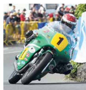
If the Classic TT happens you can be sure McGuinness will be in action

that, but he also said there will be a bike there for me. So as long as my arse points to the ground and I'm able to do it, I will go down Bray Hill again. The last TT I did I didn't cross the finish line and there is no way I'm ending my TT career like that. It's going to be tough though, I missed 2017 and 2018, then 2019 was disastrous, I missed 2020 due to the coronavirus pandemic so to not get to race in 2021... I'm not one for looking at stats but I've done 99 TT starts - I've just got to make it to 100.