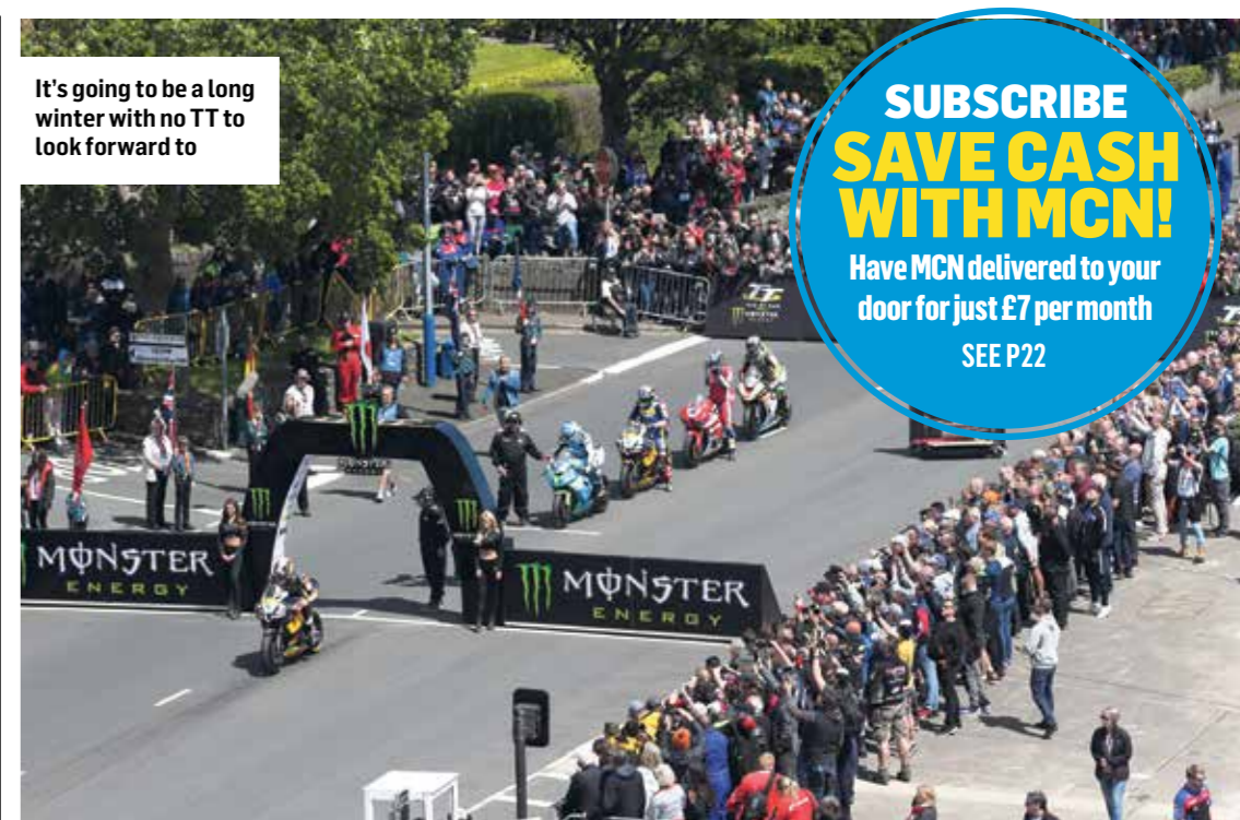
It's going to be a long winter with no TT to look forward to