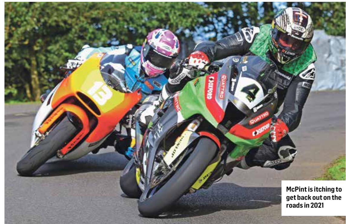
McPint is itching to get back out on the roads in 2021

which will mix classes up a bit We could see a bit more focus on Superstock too, which makes sense. They look spectacular, they do 133, 134mph laps and are dead reliable. Plus you could ride the same bike in Superstock, Superbike and the Senior. They are talking about changing the schedule and if they do they'll need to be a bit careful. It's alright sitting in the control tower but wrestling a bike round the TT course isn't easy and 11 laps is over 400 miles... flat out! But one thing that is really good about the TT is that the organisers speak to the riders. They don't