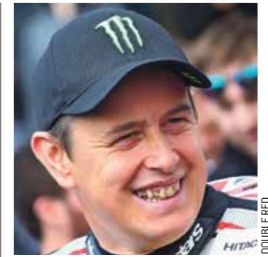
Fingers crossed there will be more to smile about come next year

just say 'this is what we're doing, like it or lump it'. I'm still hoping the NW200 will happen. They should do it after Knockhill BSB so that everyone is that much closer to the ferry. It's the same for the Classic TT and my Kawasaki team boss is already looking for a bike he can start prepping for me. So hopefully it'll be a year racing the Ducati Cup, maybe a couple of Scarboroughs, NW200 and hopefully Macau. I want as many things to look forward to as possible! Here's to 2021!