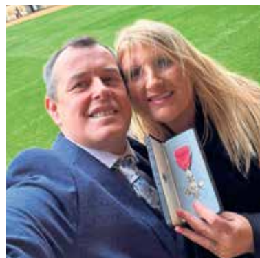
Surely a knighthood beckons...

Some wise words... "As a young motorcyclist, you take long rides until your tank is empty. As an old motorcyclist you take short rides