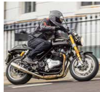
The spec sheet doesn't tell the full story with bikes like the Norton

Loved the article on Moxie and Jess – the perfect bond: rider, bike 'n' dog (MCN, April 5)! And all the kit to enable others to do the same. Peter Scatchard, Oxford