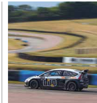
McGuinness says when the turbo kicks in the car 'definitely gets your attention'

My passion is bikes, but after that it has to be cars - it's not golf is it? I love any form of motorsport.