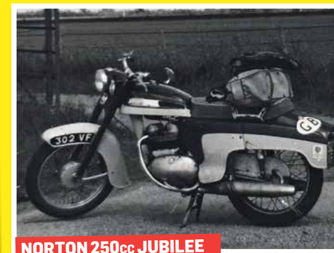
NORTON 250cc JUBILEE