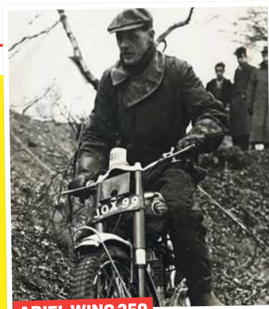
ARIEL WING 350