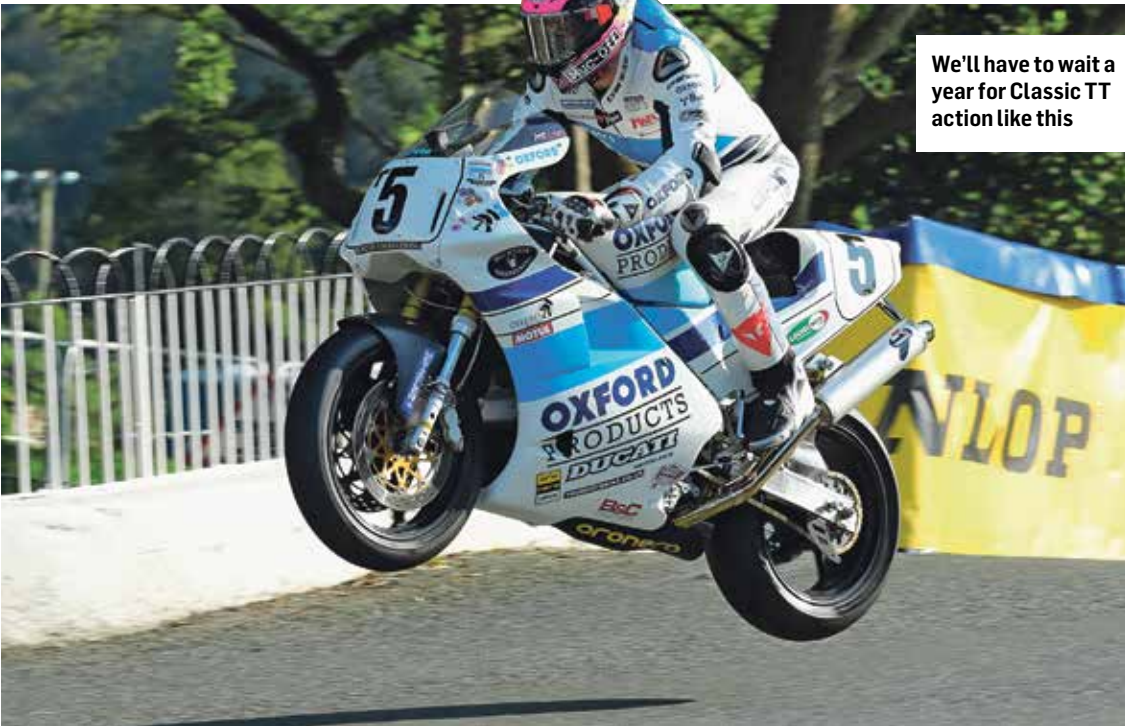
We'll have to wait a year for Classic TT action like this