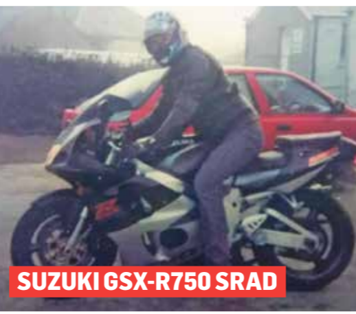
SUZUKI GSX-R750 SRAD