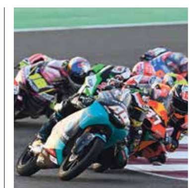
It's probably best that the Moto3 boys can't go quite as fast eh?

As spectators, speed is what we talk about and it's what we want to see. And while at some tracks they won't be going that fast, let's see what they do at Mugello where they'll be going even quicker.