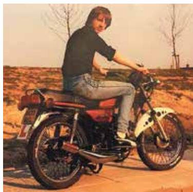
Anyone know where this RXS is?

I recently started reading MCN again and look forward to my weekly fix. I must say that Triumph are missing a golden opportunity to capture a market being exploited by Royal Enfield. Stop building BMW copies. Let's innovate, I just want a small economical bike that I can tinker with and take a pride in. I would love to buy another Triumph but don't want to ride round the world or zoom round a race track bum in the air and wrists on fire!