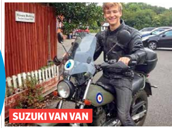
SUZUKI VAN VAN