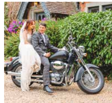
Wedding car? The Honda Shadow will do just nicely, thank you very much