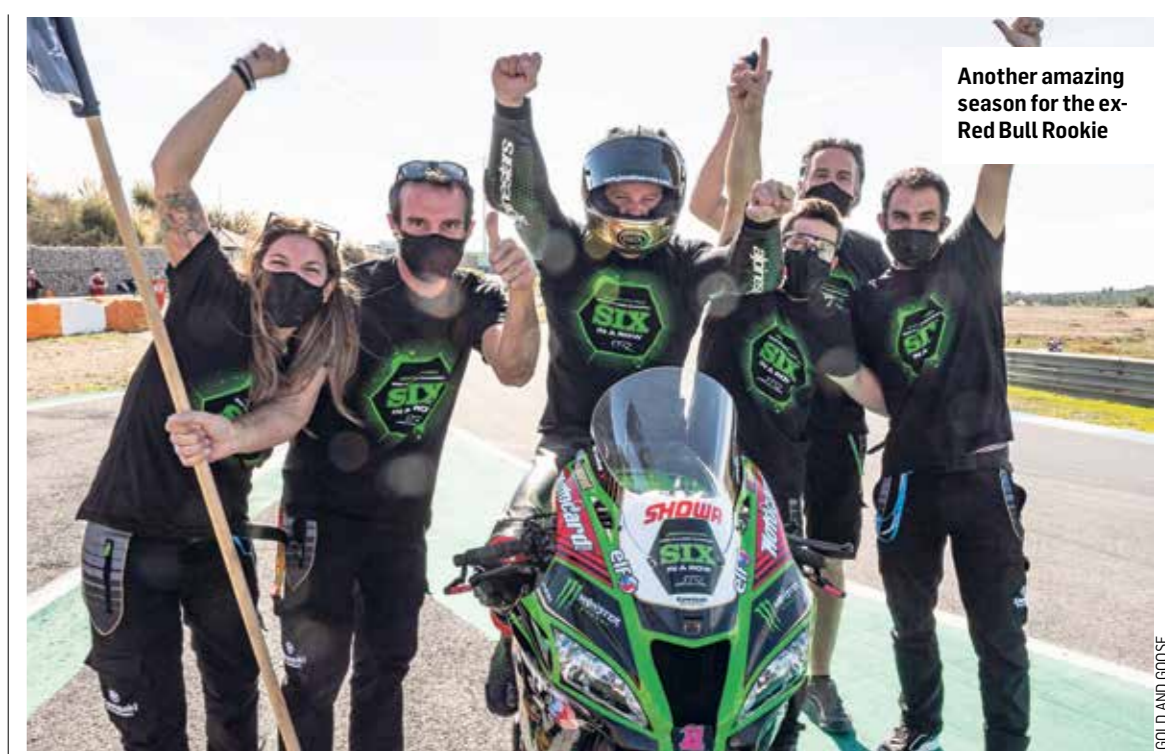
Another amazing season for the ex-Red Bull Rookie

M assive respect to him because he's had some great rivals over the years, they've all had a go. They end up a couple of tenths of a second off Johnny and over 10 laps that's two seconds. He's made world-class riders look like dicks. He's going to go down in history – records generally do get broken but it's going to take a long time. Foggy won four titles but he never back-to-backed them like Johnny. He's earned it this year. Honda have thrown the kitchen sink at