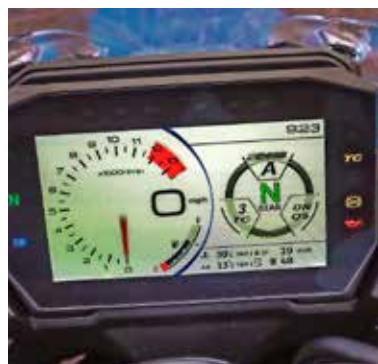
Great bike, shame about the fuel light

Unbelievable that of all the adventure bikes out there, the one Charley Boorman wishes to have in