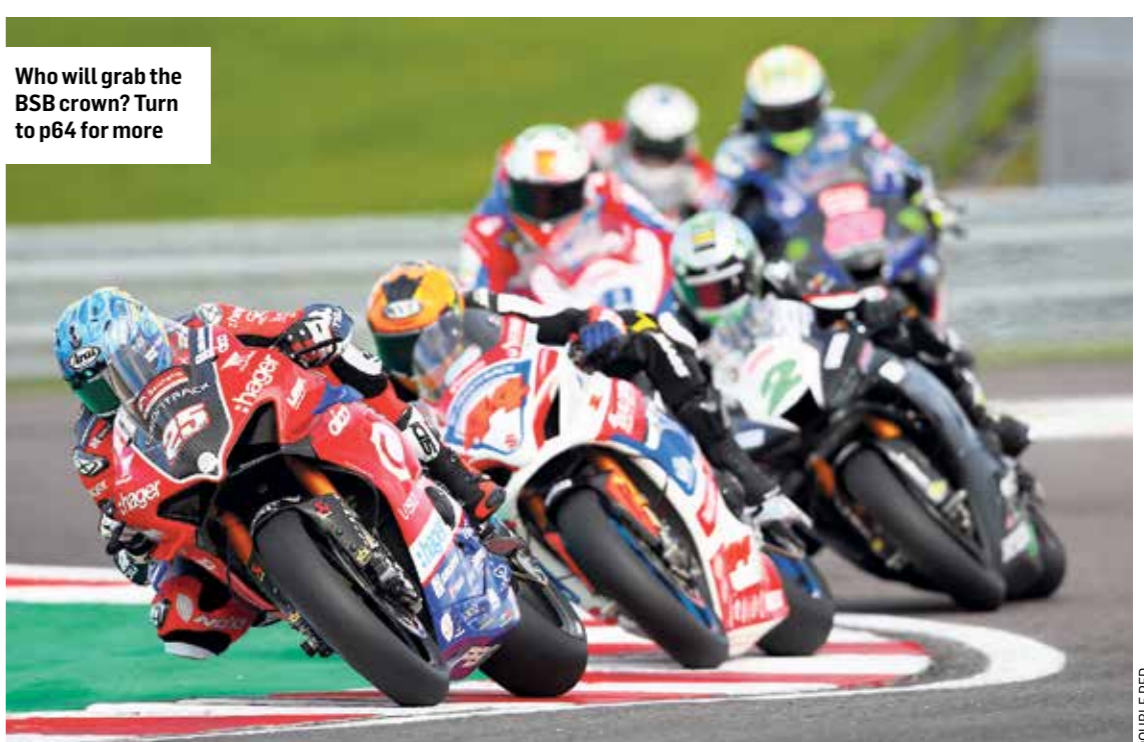
Who will grab the BSB crown? Turn to p64 for more

tenner, you'd have it on Brookes. Other riders that are fighting for No1 might hate me saying it, but the cream rises to the top. But saying all that, who knows what Brands will bring? It's October and it could be wet in one race, damp in the other and dry in the third. We've seen lots of things happen there. Kiyonari crashed in practice one year and that was it – title gone. They've all done a fantastic job given the circumstances this year. Honda had an all-new bike and a lot of the teams had problems getting the new tyres to work. Iddon has thrown a curve ball