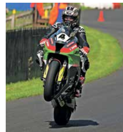
Something tells us McGuinness loved getting out on the Scarborough laps

is doing, but I always have to rely on the crew to sort it for me. You'd think that after racing for 30 years I'd know how to fix things, but hand-on-heart I don't. And that is why having the right people around you, as I've always said, is so important. Riding the Kawasaki has re-lit my fire. I've got to work around the aches and pains I get from being older, but the drive is still there, my eyesight is still there and I'm probably not any worse than before I had my crash in 2016. Yeah, my stubble is a bit grey now but apart from that I'm good to go. Bring on 2021.