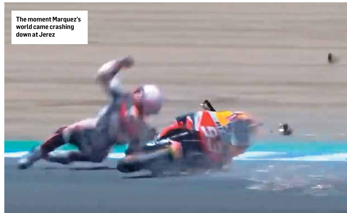
The moment Marquez's world came crashing down at Jerez

You just wonder what goes through his head, I know you can't keep a good man down, but even a pig knows when it's had enough. It was a fantastic to see him come through the pack – absolutely magic. The way he was battering past Espargaro, Rossi, Dovizioso etc. And the save he made before all that was super