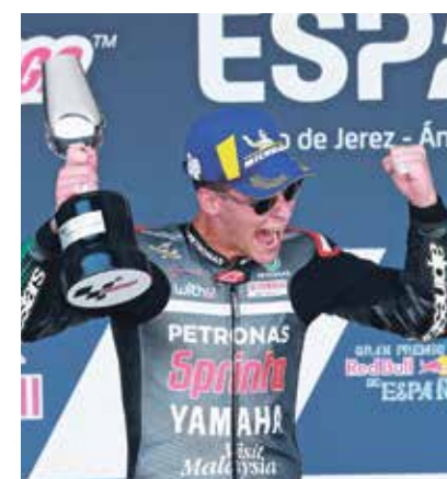
Quartararo didn't put a foot wrong, the win wasn't handed to him by the crash

Fabio Quartararo's maiden win was ultimately over-shadowed by Marquez's crash. Did he get it handed to him on a plate? No way. Saying that Marquez crashing knocked the edge off it.