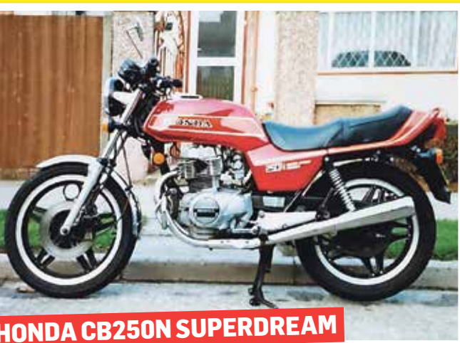
HONDA CB250N SUPERDREAM