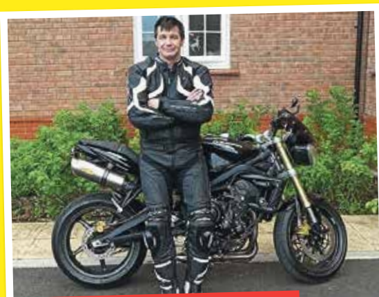
TRIUMPH STREET TRIPLE

Send your first bike pics to: yourpics@motorcyclenews.com