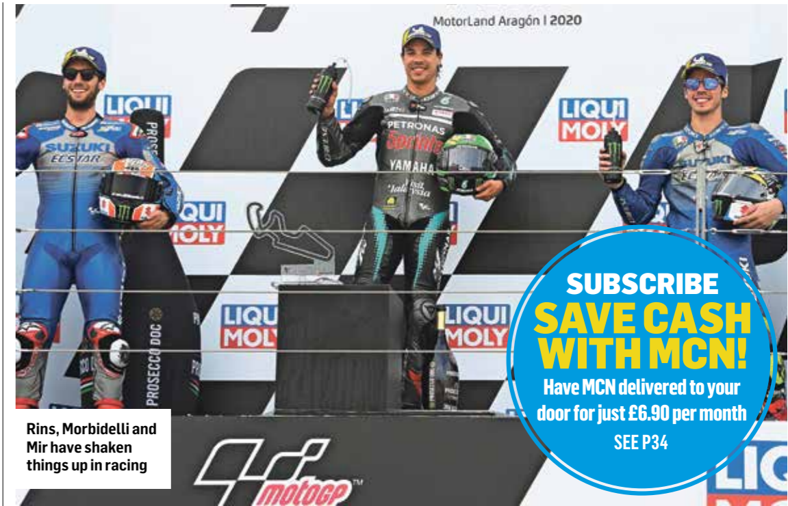
Rins, Morbidelli and Mir have shaken things up in racing

winning a race then he's a clever boy, isn't he? It'll mean he's not been sucked into the pressure – he's understood his strengths and the strengths of his bike and instead of over-thinking it, he's just gone out every weekend and ridden to the best of his ability. With three rounds to go he should carry on doing what he's doing. If he tries to come out of his bubble and win a race, that could be where it goes wrong. Quartararo is choking a bit and because of the depth of talent in MotoGP he's paying the price because a slightly off day means you're fighting to be in the top 10.