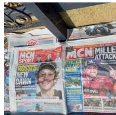
It's all coming up roses for Miller...

Just used up a load of old MCNs as 'newspaper lasagne' where you lay around 10 sheets on flowerbeds, give them a soaking and cover with mulch. Keeps the plants happy and stops weeds. Thanks MCN! Andrew Smithers, email