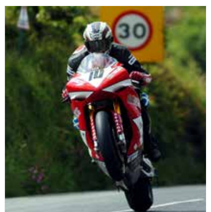
OK well sometimes you are allowed to be on the pipe through a 30... it's the TT

I think a lot of the talk about exhausts is people are bored and they're looking for something to moan about. They haven't got anything to talk about, so they bring up something irrelevant. Everyone has a bit too much time on their hands!