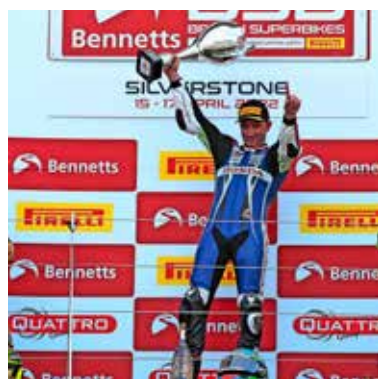
Irwin is off to a dream start in BSB

Totally agree with your item on stamping out fake motorcycle gear, but we tend to be our own worst