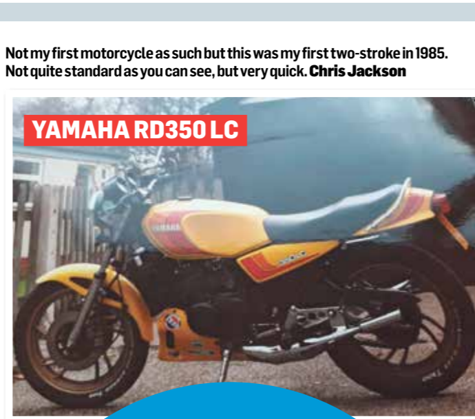
YAMAHA RD350 LC