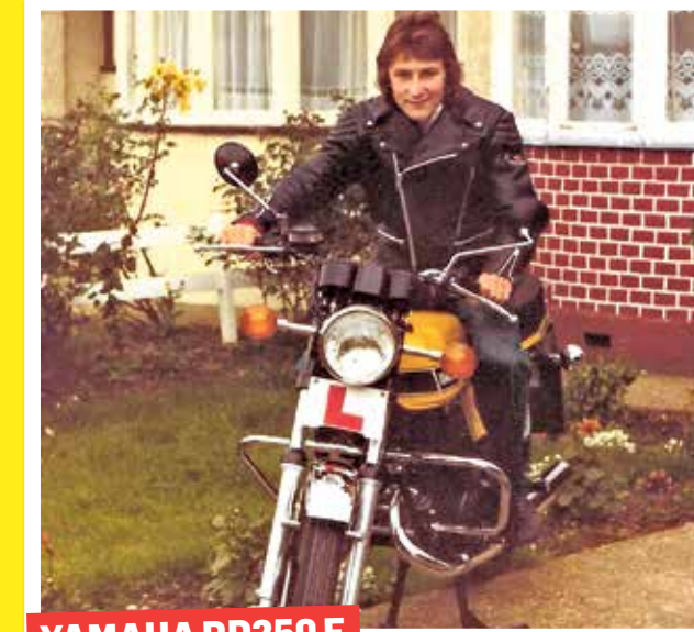
YAMAHA RD250 F