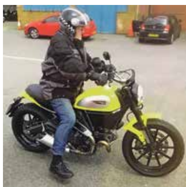
85 next month and still going strong

I like the new TT format but I don't believe that it will happen next year unless the Tynwald Government can override our own in allowing people to travel to the island again - the last two years must have been devastating for the many businesses