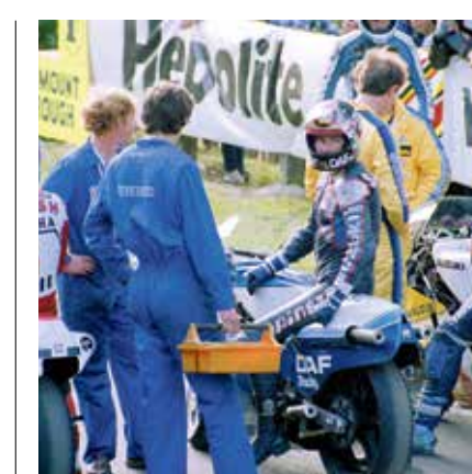
McGuinness used to go and watch the

ICGUINNESS AT MCN'S ALLY PALLY SHOW THIS WEEKEND!