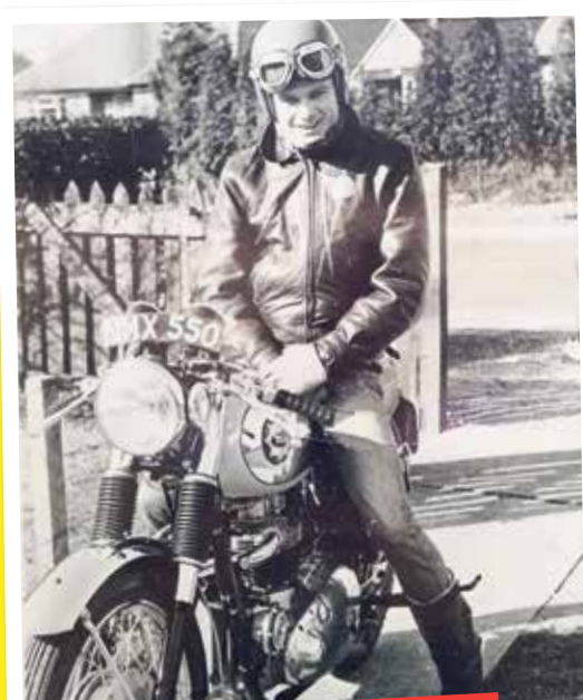
BSA ROCKET GOLDSTAR