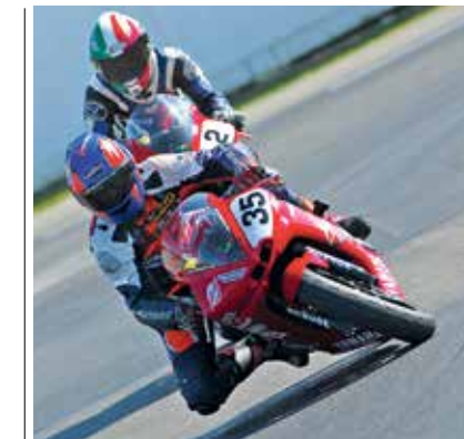
Riders like Cal are a different class but the R6 Cup gave him a leg up in racing

So for me this type of racing for young riders has to be good. Countries like Spain and Italy have been investing in one-make series and academies and they're leading the way. There are always a lot of fast Spaniards in MotoGP, and it's fair to say they've done a bit. Then there's Rossi whose academy is producing Moto2 world champions and MotoGP riders.