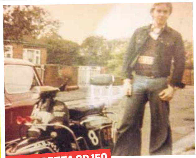
LAMBRETTA GP 150