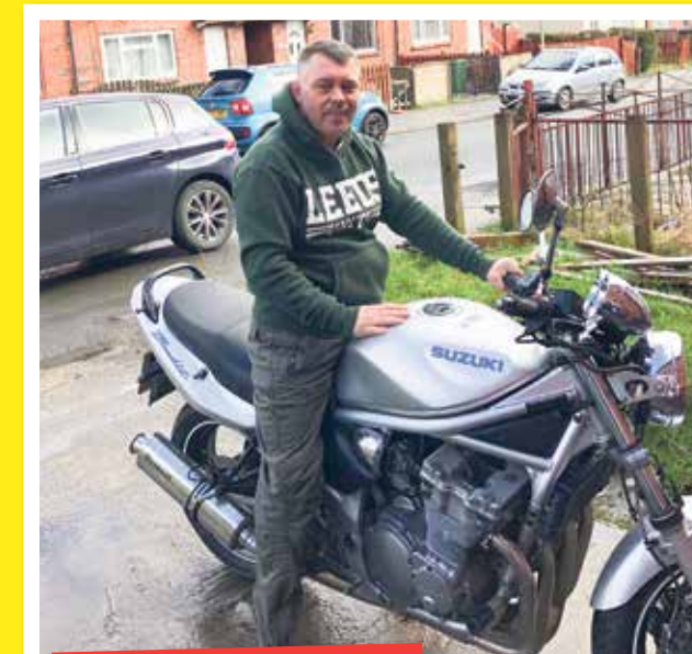
SUZUKI BANDIT 600