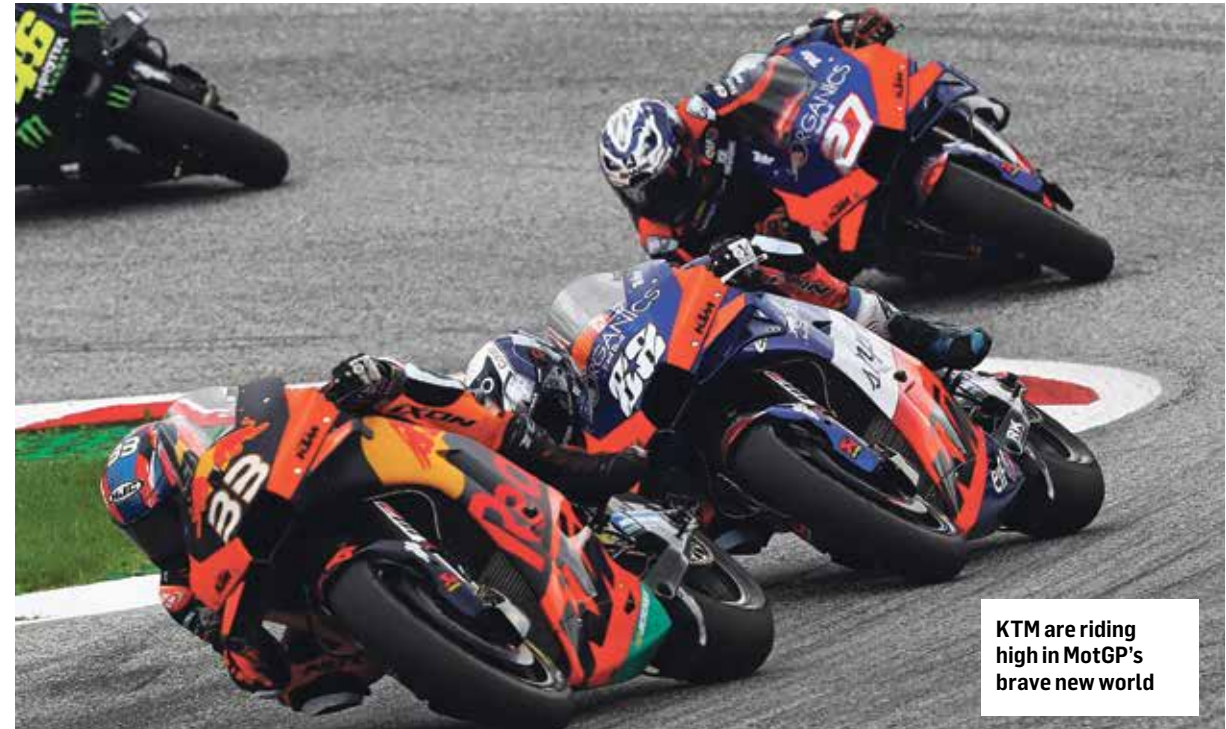
KTM are riding high in MotoGP's brave new world