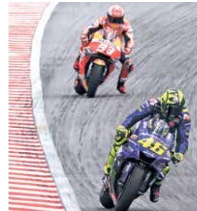
Rossi showed who was boss at Sepang last year (before crashing out)

I guess Yamaha just need to put together the best bike... they've had their issues but they're still one of the best aren't they? I hope so anyway, it'd be awesome to see Rossi taking it to Marquez again.