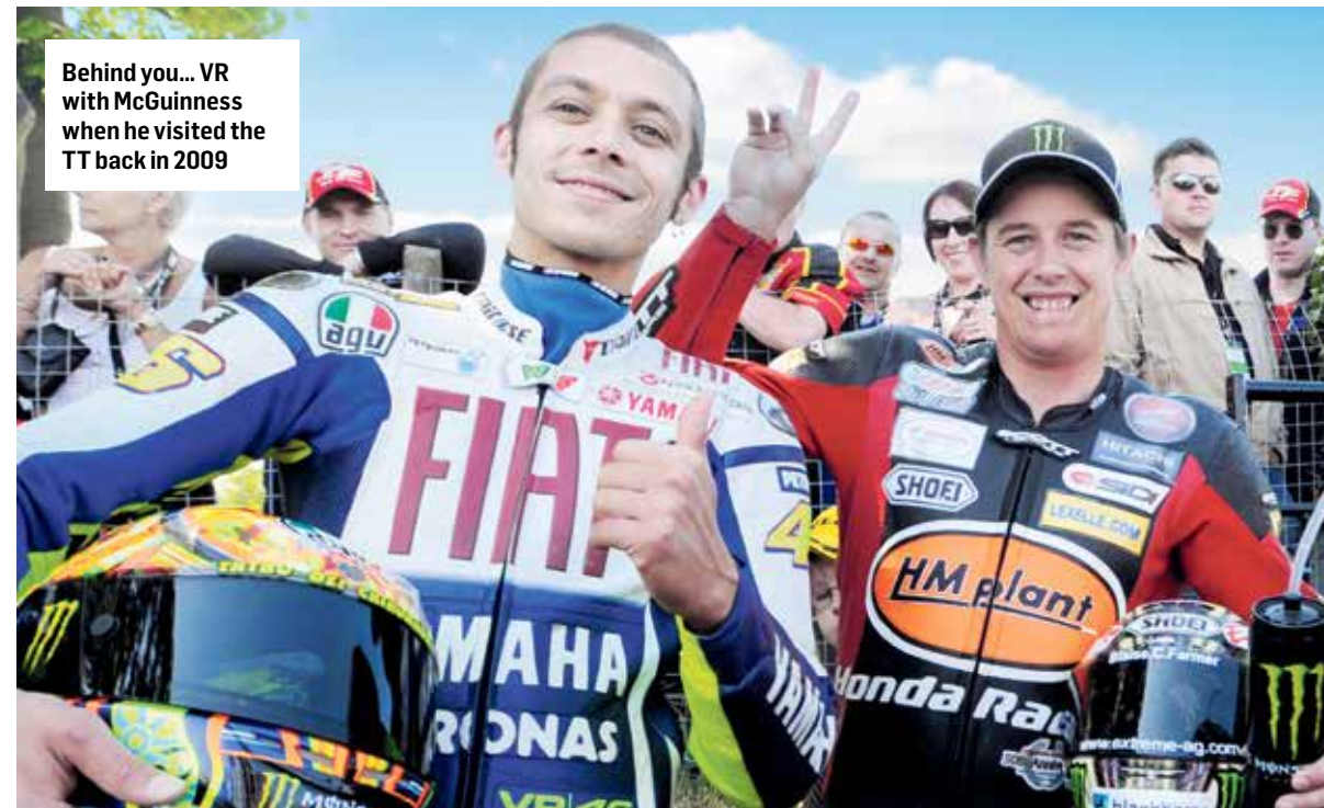
Behind you... VR with McGuinness when he visited the TT back in 2009

He's at his training ranch every day sticking the work in, so I don't think there's any reason he can't fight for the title. He needs a good start to the year to keep that confidence up. And he isn't bothered about bashing handlebars these days, he's changed his style to be quicker in recent years.