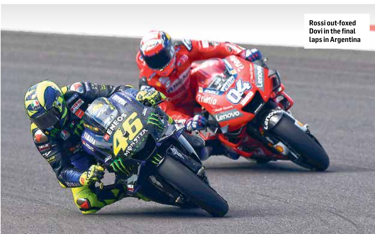
Rossi out-foxed Dovizioso in the final laps in Argentina

Rossi is as tough as they come and he's got a team-mate who can put it on pole but can't do it in the race. And Rossi has shown he's still cunning. Look at Argentina he was clever to be able to beat Dovizioso. He out-foxed him by going early. It should be Viñales and the younger guys taking the fight to Marquez and Dov. But they aren't delivering yet, whereas Rossi is. I speak to Rossi on WhatsApp. We have a bit of banter, he always