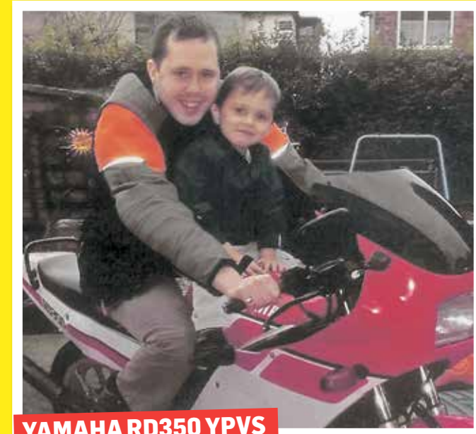
YAMAHA RD350 YPVS