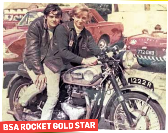
BSA ROCKET GOLD STAR