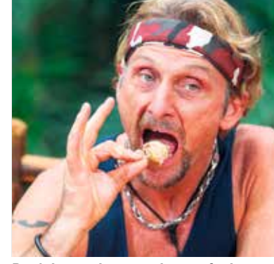
Don't know about you but we feel more

McGUINNESS RATES 2019'S NEW BIKE RELEASES