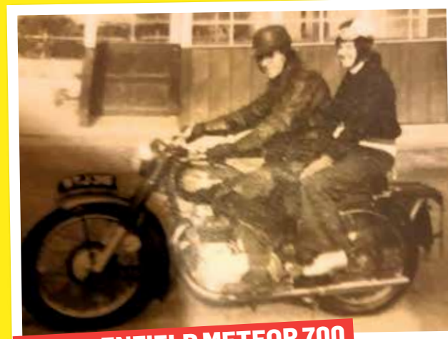
ROYAL ENFIELD METEOR 700