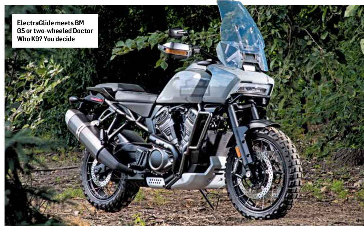
ElectraGlide meets BM GS or two-wheeled Doctor Who K9? You decide

In fact I'm not sure where they are going to go with it at all. Who will buy it? It's massively out of Harley's comfort zone so it doesn't make much sense. I can't