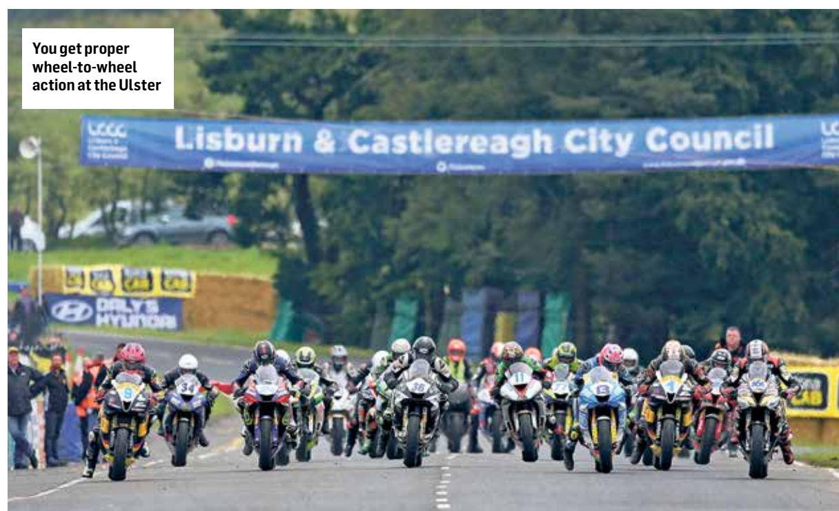
You get proper wheel-to-wheel action at the Ulster