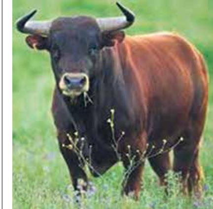
'Think I'm moo-ving out of the way for you and you've got another thing coming'

one of my fingers is shorter than it should be. Birdy took delivery of a brand new 999 Ducati and they called me up and told me to chuck some miles on it to run it in. I know the roads round here like the back of my hand and there's this jump I like to do. But this time I was going pretty quick and when I landed the back wheel just spun. I looked down and I'd ripped the sump off. That was an embarrassing phone call. I'm a bit calmer on the roads these days, but I'm sure there'll be more fun and games in 2019. Stuff just seems to happen to me.