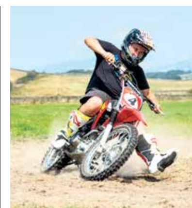
McGuinness reckons there is room for everyone to enjoy the countryside

Enduro riding is a sport, you're never going to stop people from doing it and if you start making it more difficult that's when you start making things more dangerous.