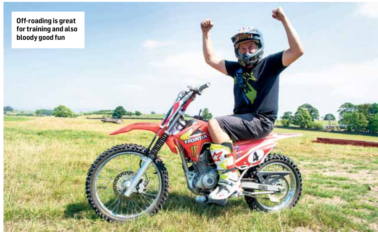
Off-roading is great for training and also bloody good fun

There's no give and take, it's such a shame. I find it difficult to express it as I get so mad! We put petrol in our bikes, we'll stop at the pub for pie and chips and we're putting back into the