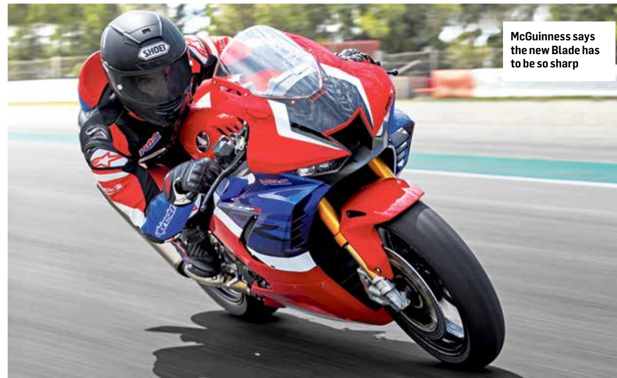
McGuinness says the new Blade has to be so sharp

I've had a look at the new Blade. I don't mean to be disrespectful, but it looks like a BMW with wings thanks to the design of the subframe and seat unit. But it's got its Honda touches and the iconic colours, so it looks good. I'm still unsure how much difference the wings make. There was a GP recently where Alex Rins had a set knocked off and the commentators were saying that it was now going to steer better on the lefts than the rights, but it didn't seem to make any difference to his pace. I reckon if you blindfolded a rider so they