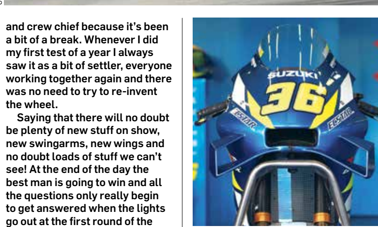
As the machines wheel out on track it's a

It's a hard one to judge where everyone is, but at the end of the day everyone gets some decent track time, which is what it is all about. The clever riders will just be doing their thing and not worrying about lap times during the opening test. They've got the experience so they won't be sticking their necks out, they don't want to end up upsidedown in the gravel, they just want to be putting the mileage in and bonding with their team