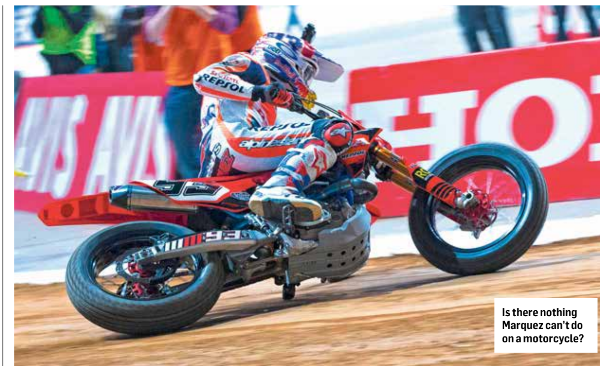
Is there nothing Marquez can't do on a motorcycle?

It's like when a young guy starts racing and they're fast, but crashing a lot. It's easy to pull these people back three steps and then take four steps forward. But it's much harder to get a rider to take those steps