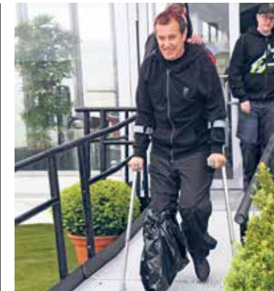
Leaving hospital was just one step on the long and painful road to recovery

I am really looking forward to 2019, to racing the Norton and to getting a few more race wins under my belt. In the meantime, I'm going to get stuck into a bit of turkey. Happy Christmas all!