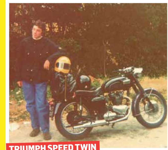
TRIUMPH SPEED TWIN