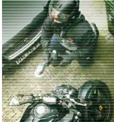
Hmmm, now what could a chap with an angle grinder be up to with a parked bike?

I guess the only thing is I hope the police forces are knocking the right people off their bikes! They need to be sure they are definitely bike thieves because if innocent people are being knocked off they don't deserve to be getting hurt. Let's face it, riders on the road have enough problems with cars as it is!