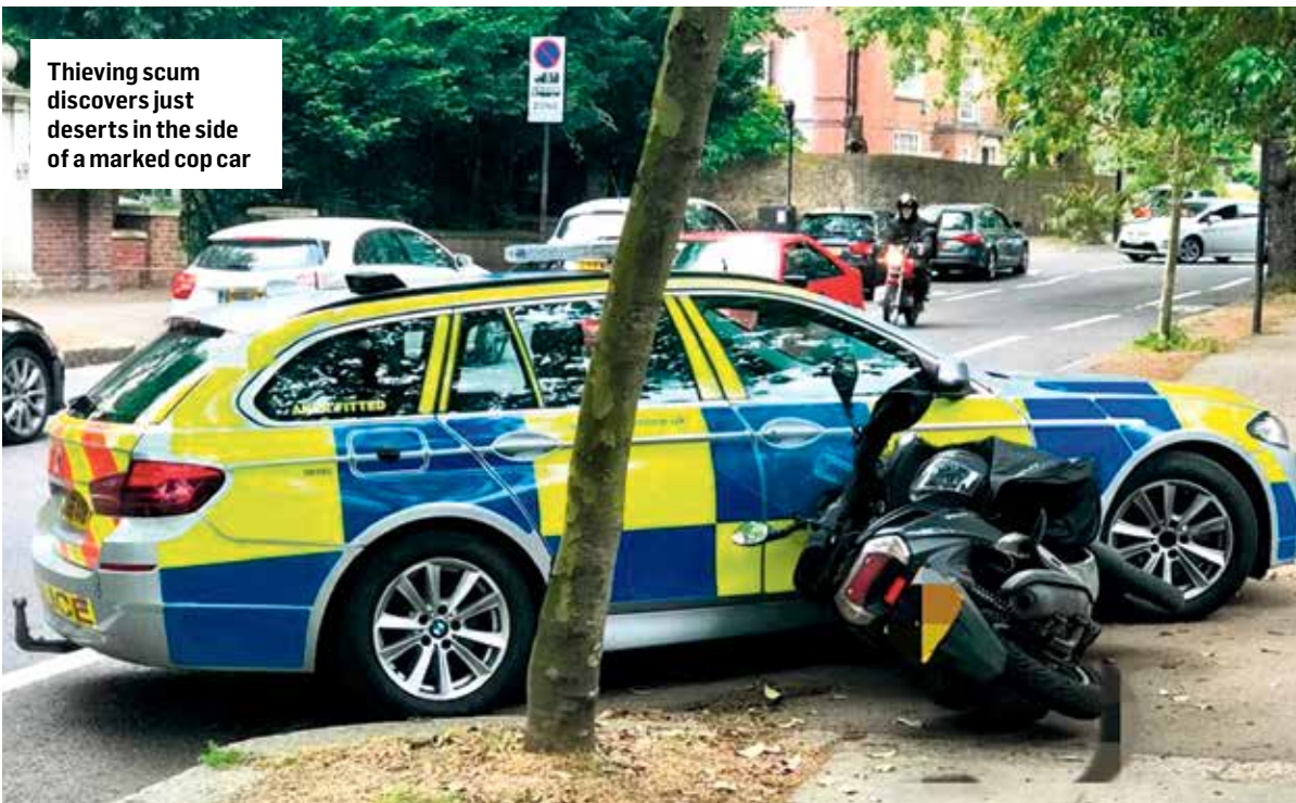
Thieving scum discovers just deserts in the side of a marked cop car

It really needs to be nipped in the bud if we are going to stop it. If you are swinging a cordless grinder in someone's face one minute, then you deserve to be