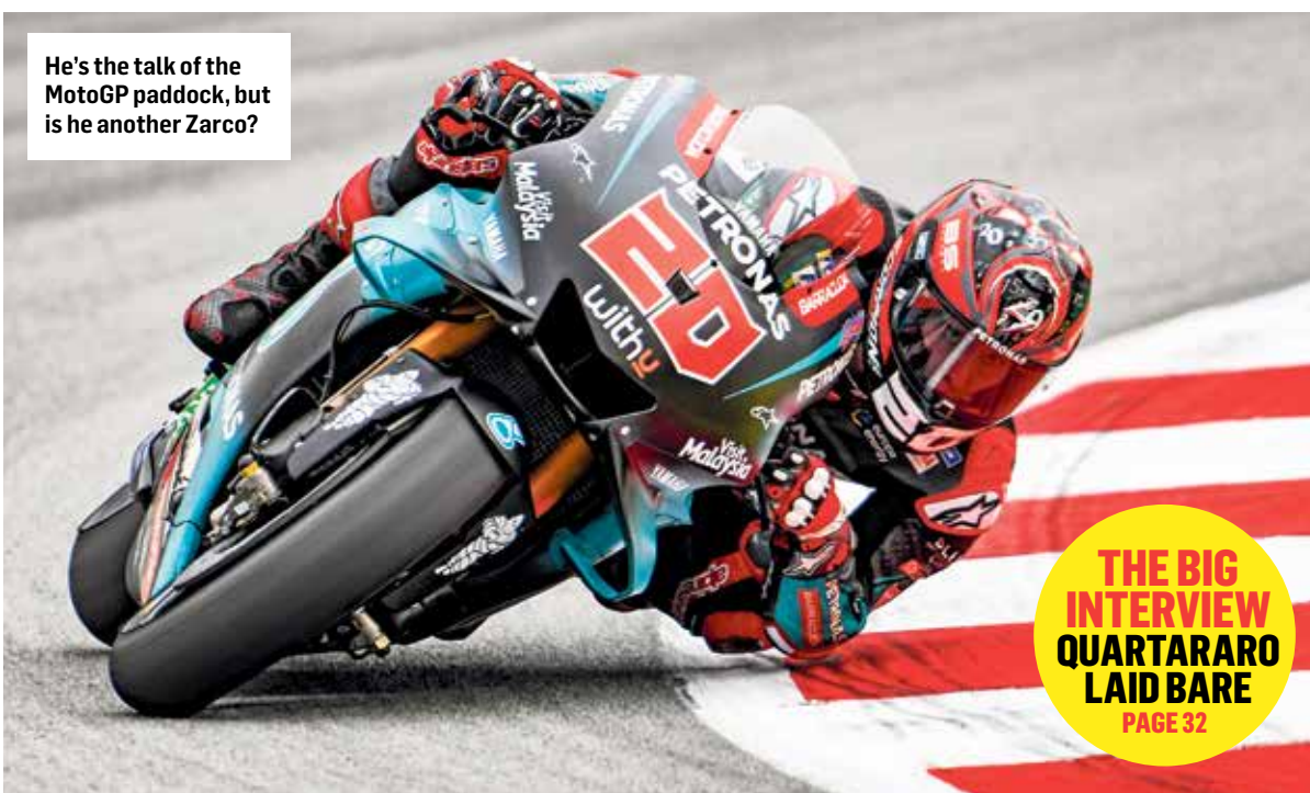
He's the talk of the MotoGP paddock, but is he another Zarco?

the podium, Edwards used to do well on it too, but although I'll get shot for this they are riders who weren't at the very sharp end. I'm not going so far as to say the Yamaha is flattering, because I have so much respect for all the riders in MotoGP as I know that if I tried a MotoGP bike I wouldn't even be able to hold on to it. 270 - 280bhp - they are unreal. So for Quartararo to jump on one and do what he's doing... He also has nothing to lose, and he's prepared to have a go. He's in a position where if he keeps finishing on the podium he's a legend and if he crashes