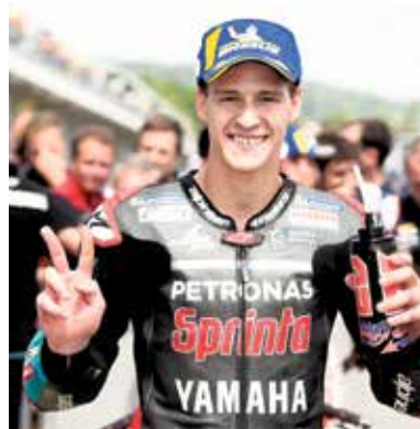
Quartararo has been persistently at the sharp end since stepping up to MotoGP